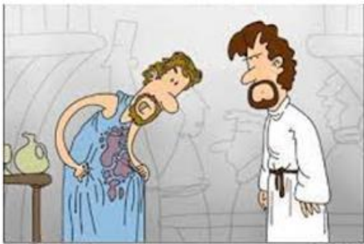
IS THERE ANY CHANCE YOU COULD TURN JUST A LITTLE BIT OF THAT WINE BACK INTO WATER?